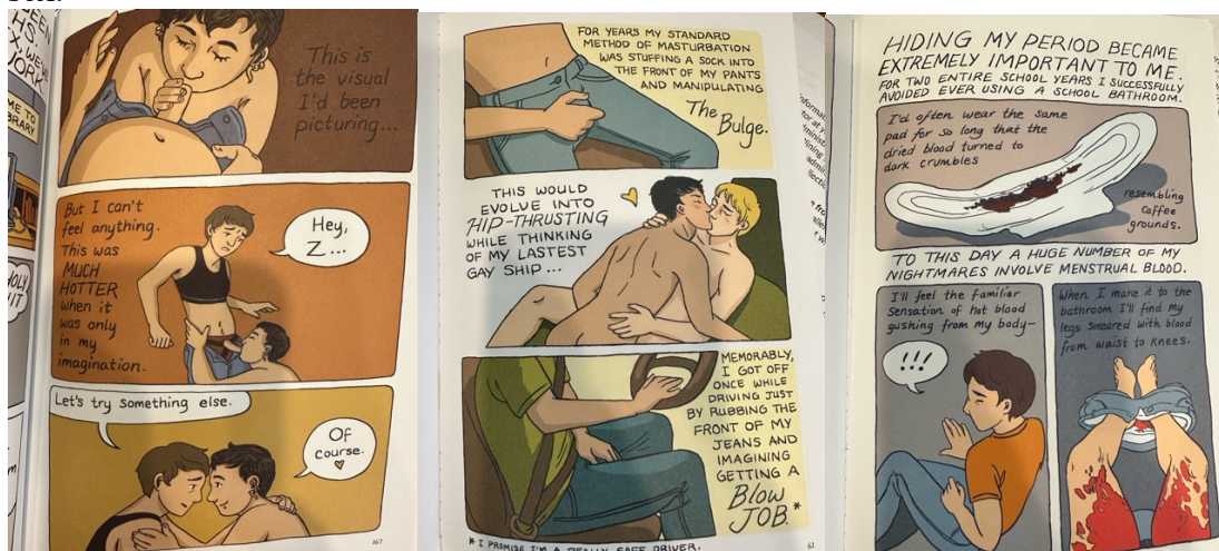
Kobabe, Maia (2019). Gender queer [Screenshots pp. 35,61,167]. Lion Forge.

The American Library Association (2024, April 8) named Gender queer as the most challenged book in 2021, 2022, and 2023 because of LGBTQIA+ content, explicit content, and explicit graphic images. Gender queer includes images and descriptions of menstruation, gay porn, sex toys, pubic hair, sexting, masturbation, and sexual relations between two males, including oral sex.